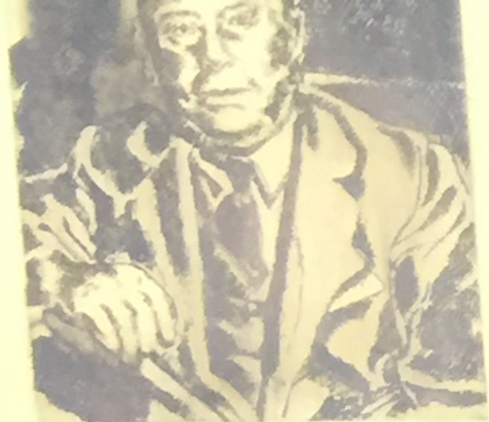
计算机之父——冯·诺依曼 Neumann John Von